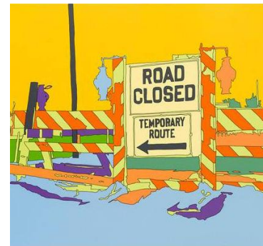
deTOUR Downtown Brainerd Crow Wing Food Co-Op Market & Fair