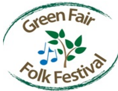
Green Fair Folk Festival